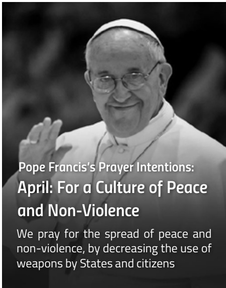
Pope Francis's Prayer Intentions: April: For a Culture of Peace and Non-Violence

San Pedro is a warm and friendly parish, providing an intimate worship environment. Learn more about us at: https://sanpedrocc.org/