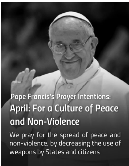
Pope Francis's Prayer Intentions: April: For a Culture of Peace and Non-Violence

San Pedro is a warm and friendly parish, providing an intimate worship environment. Learn more about us at: https://sanpedrocc.org/