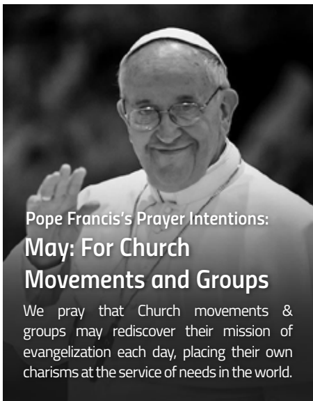
Pope Francis's Prayer Intentions: May: For Church Movements and Groups

San Pedro is a warm and friendly parish, providing an intimate worship environment. Learn more about us at: https://sanpedrocc.org/