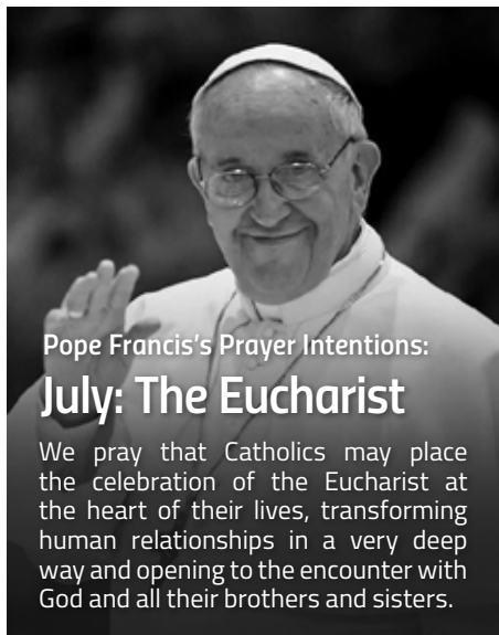
Pope Francis's Prayer Intentions: July: The Eucharist

San Pedro is a warm and friendly parish, providing an intimate worship environment. Learn more about us at: https://sanpedrocc.org/