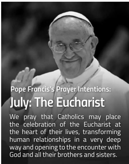
Pope Francis's Prayer Intentions: July: The Eucharist

San Pedro is a warm and friendly parish, providing an intimate worship environment. Learn more about us at: https://sanpedrocc.org/